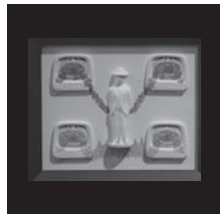
Brian Row Insatiate Greed 2003 Mixed media