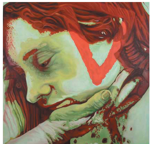
"Memories of Warmth"